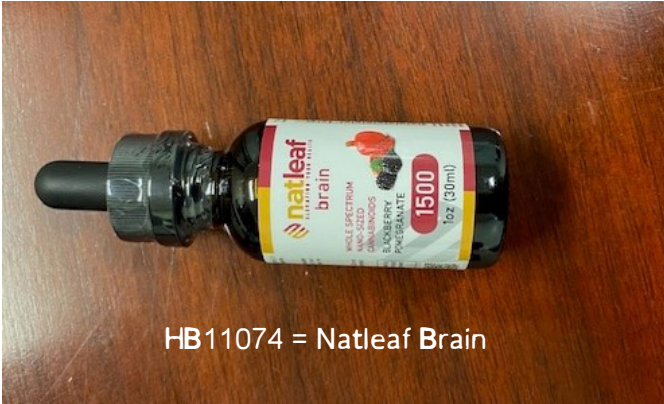
HB11074 = Natleaf Brain

Client INVENTED GREEN, LLC 7345 W SAND LAKE RD, STE 210 OFFICE 2318 ORLANDO, FL 32819 us