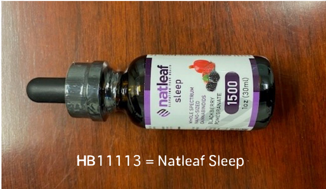
HB11113 = Natleaf Sleep

Client INVENTED GREEN, LLC 7345 W SAND LAKE RD, STE 210 OFFICE 2318 ORLANDO, FL 32819 uS